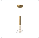
PD30502-BG/CL-UNV Brushed Gold/Clear